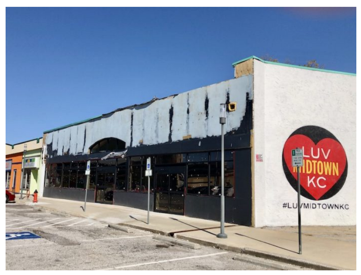
This building at 3967 Main near the planned 39th Street streetcar stop is being renovated as a grocery store.